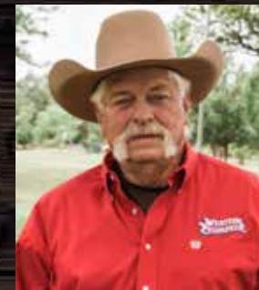
Steve Bower Grounds

Volunteers have always been the heart of our community traditions since the first rodeo in 1954. If you would like to get involved, we have a variety of ways you can participate. Or if you have any feedback please email: events@westjordan.utah.gov .